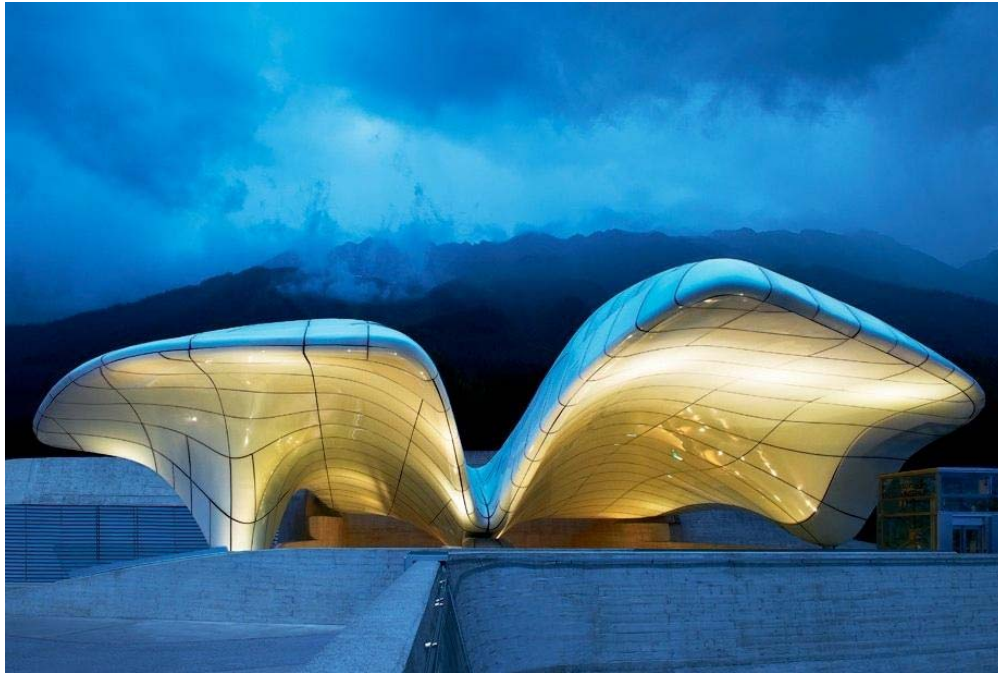
Image 3: The Nordpark Railways Stations (2007) - Hungerburg Station Image copyrighted & courtesy of Martin Schubert.

The Nordpark Railway Stations in Innsbruck, Austria are a collection of works made up of Alpenzoo Station, Hungerburg Station, Congress Station and Lowenhaus Station - all four make up a funicular railway system that is situated along Innsbruck's northern chain of mountains 9 . Each one has a unique architectural design, influenced by the topography, altitude and the neighboring ice formations of the site. While all four perform the hybrid monstrosity identity, I am concentrating solely on Hungerburg Station.