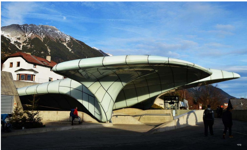
Image 2: The Nordpark Railways Stations (2007) - Hungerburg Station

This binary relationship between the beautiful and the ugly is something that has continuously surfaced within both scholarship and popular cultural manifestations of the monster. Upon closer inspection, it seems they function less as a binary and more as a close partnership; what we may initially perceive as an ugly monster may upon observation and interaction become beautiful (MacLean 49). Upon first gazing at the ski jump, one may see its concrete silhouette as a harsh mutation of the landscape, a deviant alien having migrated from elsewhere. However, upon further inspection perhaps the structure's inherent sense of beauty - its carefully crafted curves and angles, its majestic, monumental stature - starts to unravel. What the hybrid monstrosity really does is encourage us to reimagine our interpretations of beauty - the deviant merging of machine and mountain offers us new possibilities of composition and space-making (Comaroff and Ker-Shing 46). This merging can be further explored through The Nordpark Railway Stations .